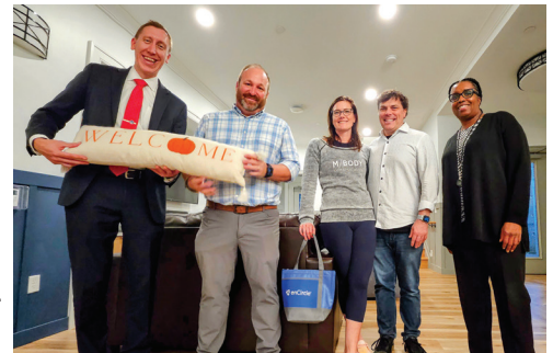
RIGHT: At the group home open house, 26 October 2023.

building certification program. The group home is looking for volunteers to help out with starting their garden, please reach out to the Douglas Park Civic Association if you would like to help out ( president@douglaspark.org ).